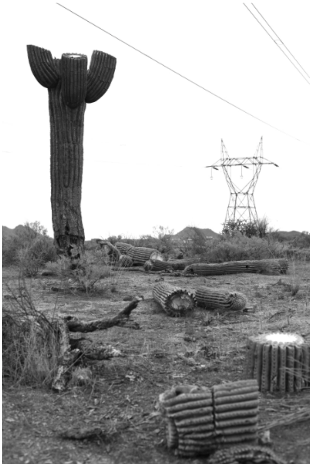
Figure 1. Photo courtesy of Jason Rugolo on Tonto National Forest near Rio Verde, Saguaros removed for transmission lines.

Pygmy-owls are currently found primarily in Sonoran desert scrub vegetation and riparian drainages and woodlands, as well as palo-verde-cacti-mixed scrub