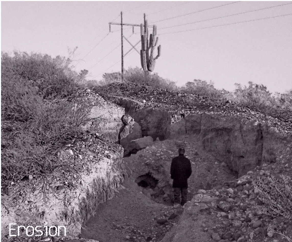
Figure 2. A photograph depicting the visual scar of erosion caused by a road.

While the ecological impacts of these proposed transmission lines are of greatest concern, the visual impacts will be extensive and unmitigable, including the significant degradation in views from designated natural areas, additional light pollution, and the erosion.